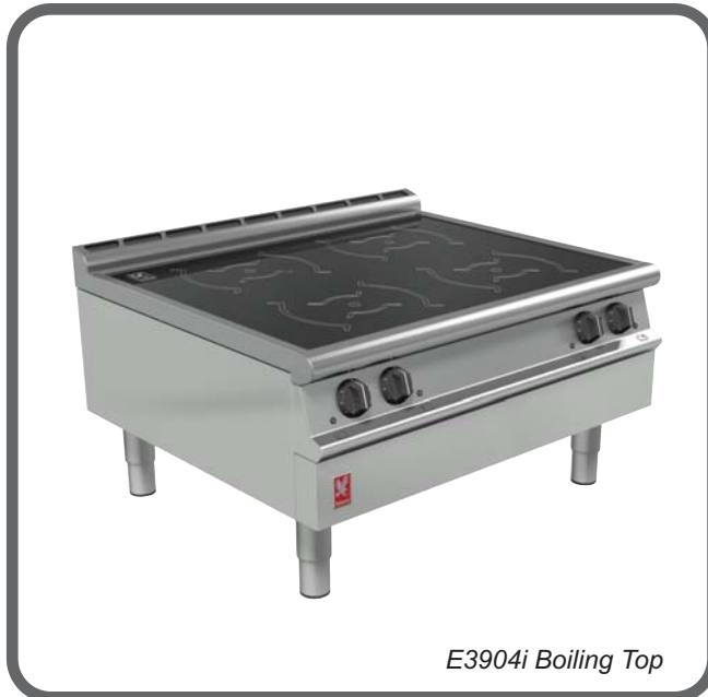
E3904i Boiling Top