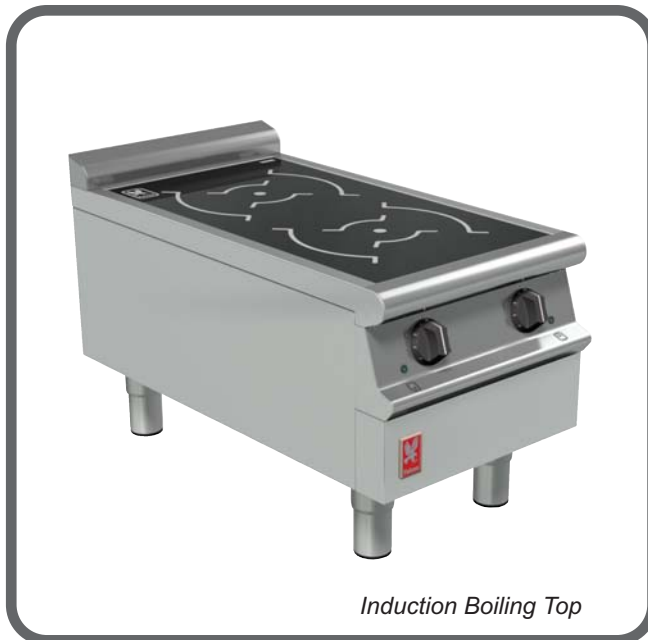
Induction Boiling Top